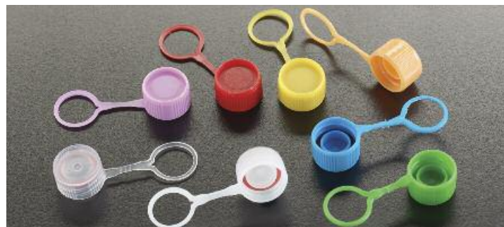
With WASHER SEAL and loop. Made of polypropylene.