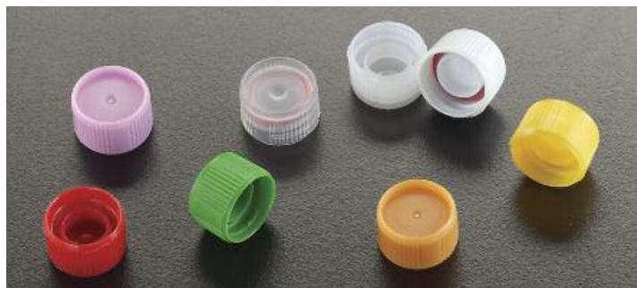
With WASHER SEAL and without loop. Made of polypropylene.

Closures can be COLOR CODED by the use of T345 Series Colored Capinsert™ inserted on the top of the closure. This is accomplished without removing the cap. Colored caps are also available in all models as listed below.