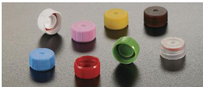
With WASHER SEAL and without loop. Made of polypropylene.

The following closures have a flat top to accommodate automatic capping machines in packaging industries.