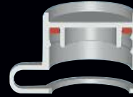
With washer seal and attachment loop